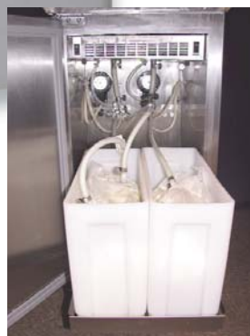
Refrigerated Storage Cabinet showing slide-out tray and bag connection system.