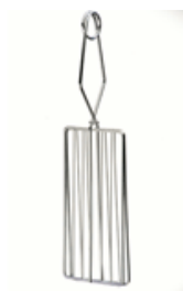
Extra long tongs