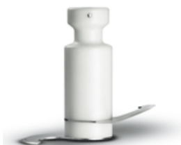
Shaft with knives to mix dough