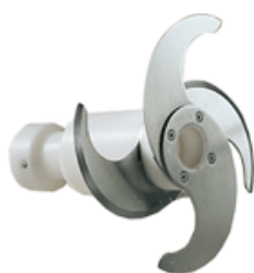
Shaft with knives for pesto sauce